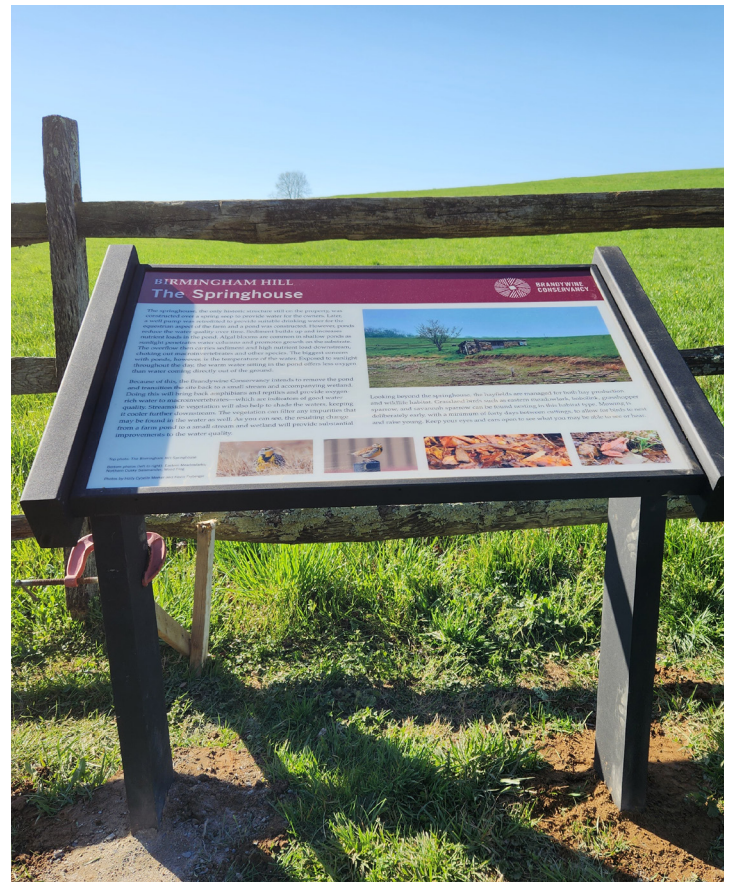
Interpretive wayside at Birmingham Hill Preserve, Chester County, PA.